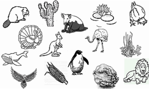
Figure 1: Images used in picture sorting task, presented in the configuration used for the stimulus sheet.

animals that were calibrated with a separate group of adult participants to be cross-classifiable into one of three taxonomic groups (mammal, bird, or plant) and one of three thematic groups (farm, water, and wild/zoo). The assignment of stimuli to thematic groups was based on the results from a questionnaire in which a separate group of adult participants rated the degree to which each possible pair of a broader range of 20 plants and animals belonged to each of the thematic groups on a 7-point Likert scale. Each of the five stimuli assigned to a given thematic group were those that achieved a rating of \geq 5.5 for that group when paired with each of the other four (see Table 1).